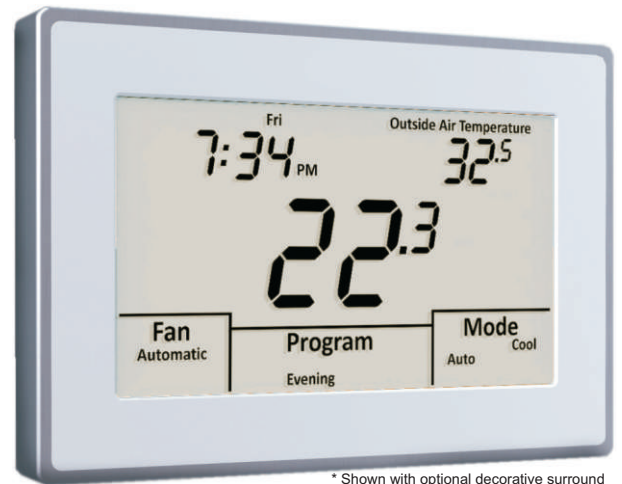
* Shown with optional decorative surround

The Apollo from Smart Temp - Simply Clever!